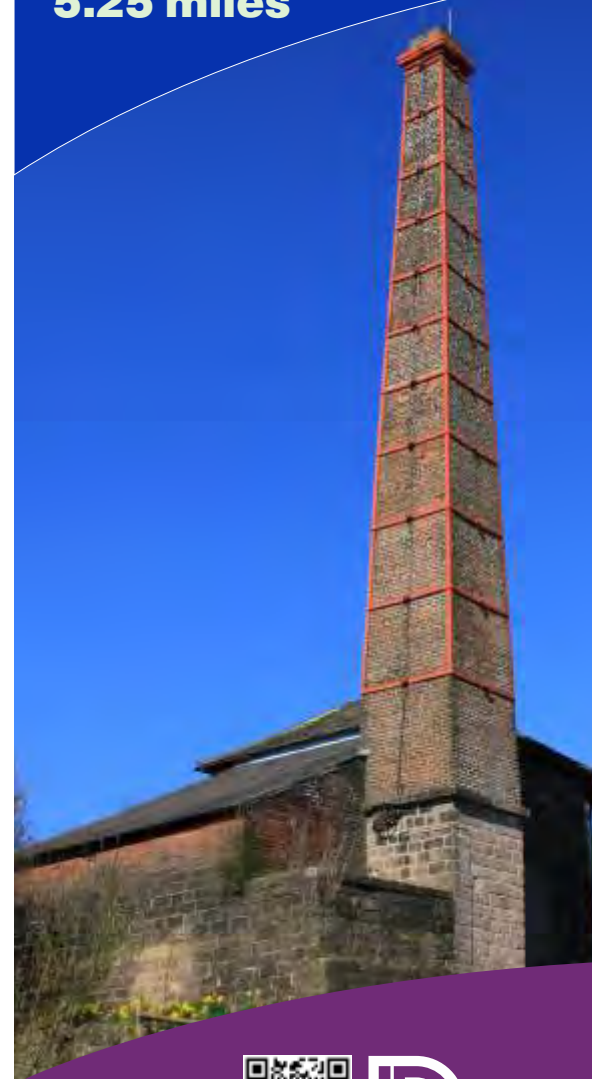
Chimney at Middleton Top Engine House